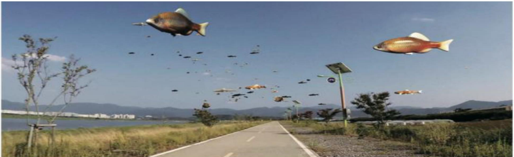
'Gangjung Riding' _ Interactive Media Installation_2015