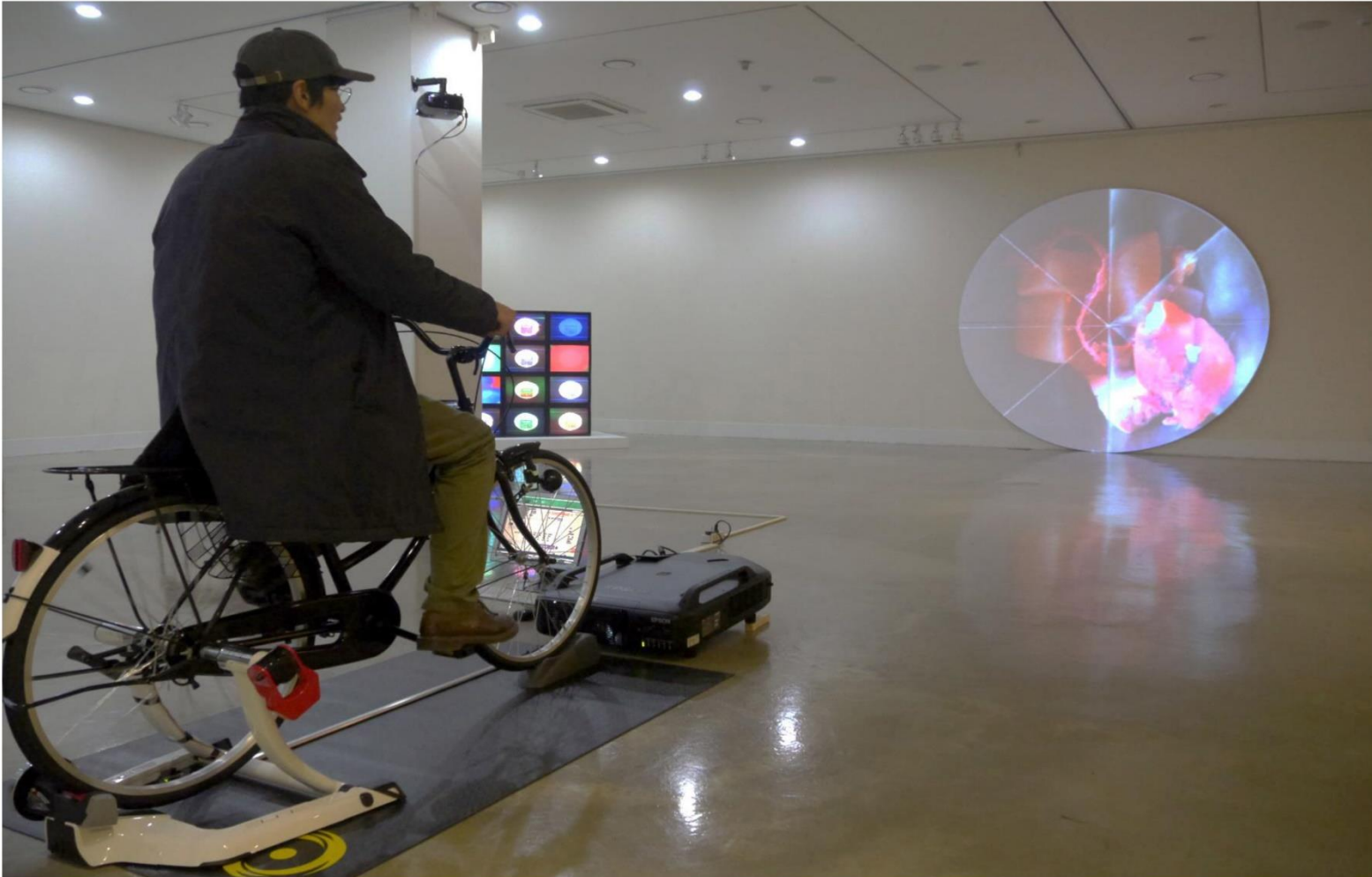
'Zero Calorie Riding'_Interactive media Installation_Variable size_2016