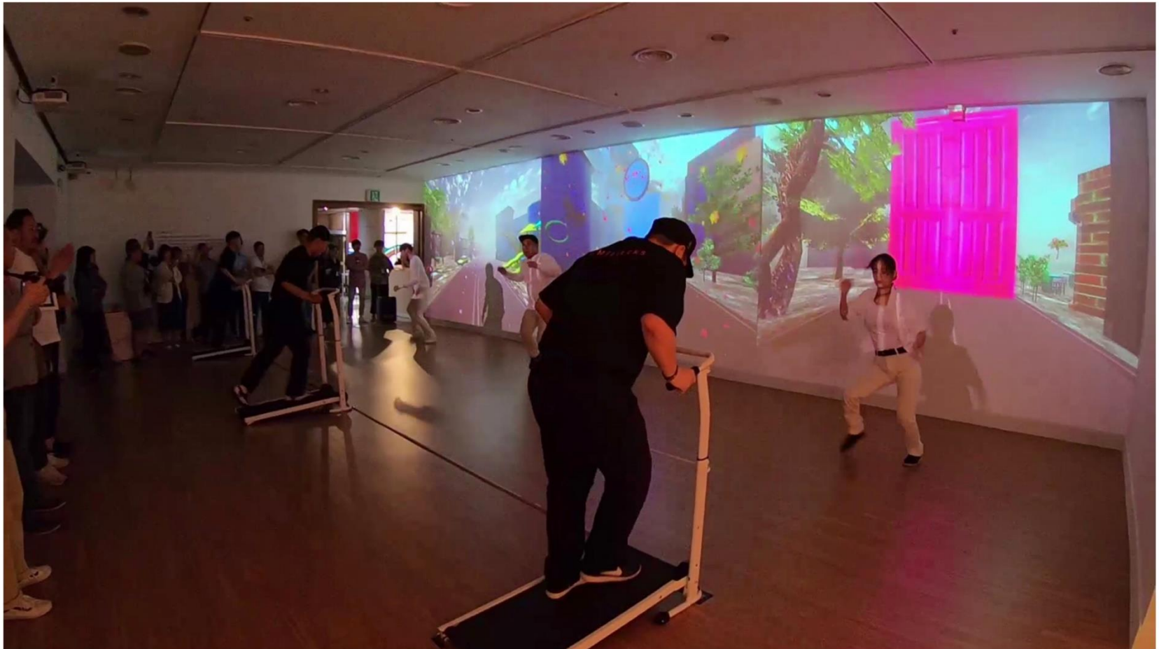
A Walk to LOCAL POST X SOUL MARKET _ Aoul Artcenter _ 2019

https://www.facebook.com/junghyang.oh/videos/2195189780550255/