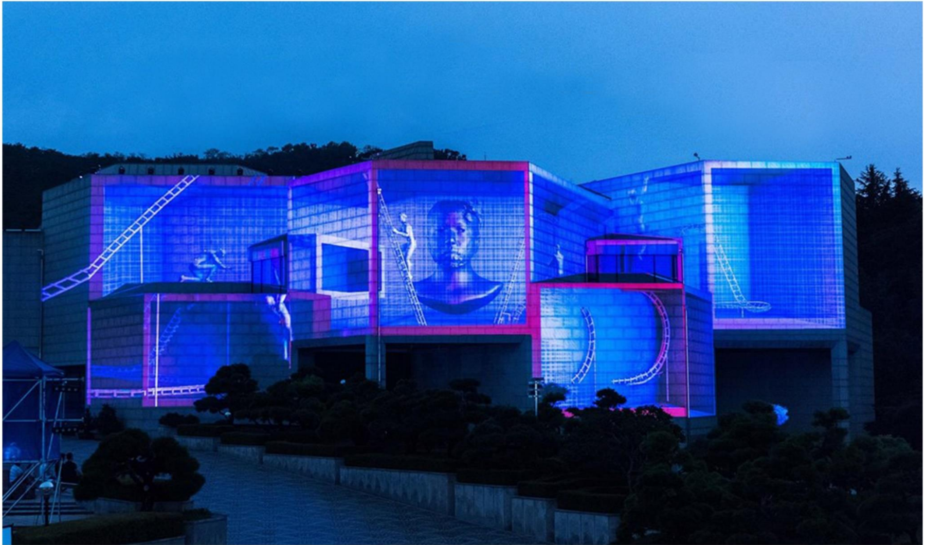
2017 In-Daegu Media Façade ‘Visible, Invisible city’ Daegu Artcenter Museum _ 2017