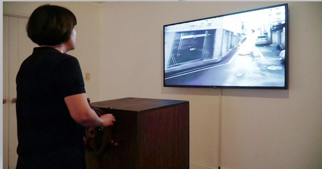
Ghost Curves_ Interactiv Video installation_Variable size_ 2016