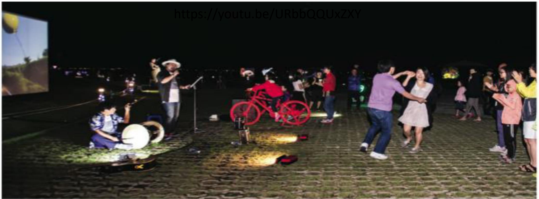
'Gangjung Riding' _ Interactive Media Installation_2015