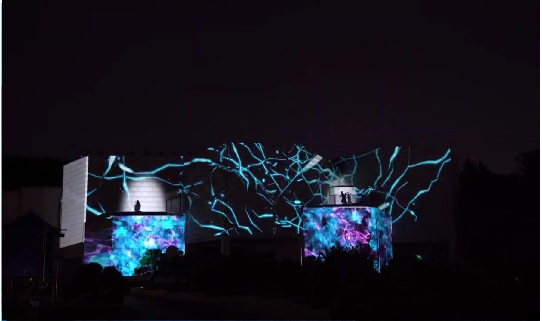
2017 In-Daegu Media Façade ‘Visible, Invisible city’ Daegu Artcenter Museum _ 2017

https://www.youtube.com/watch?v=KsXoYjzAniQ