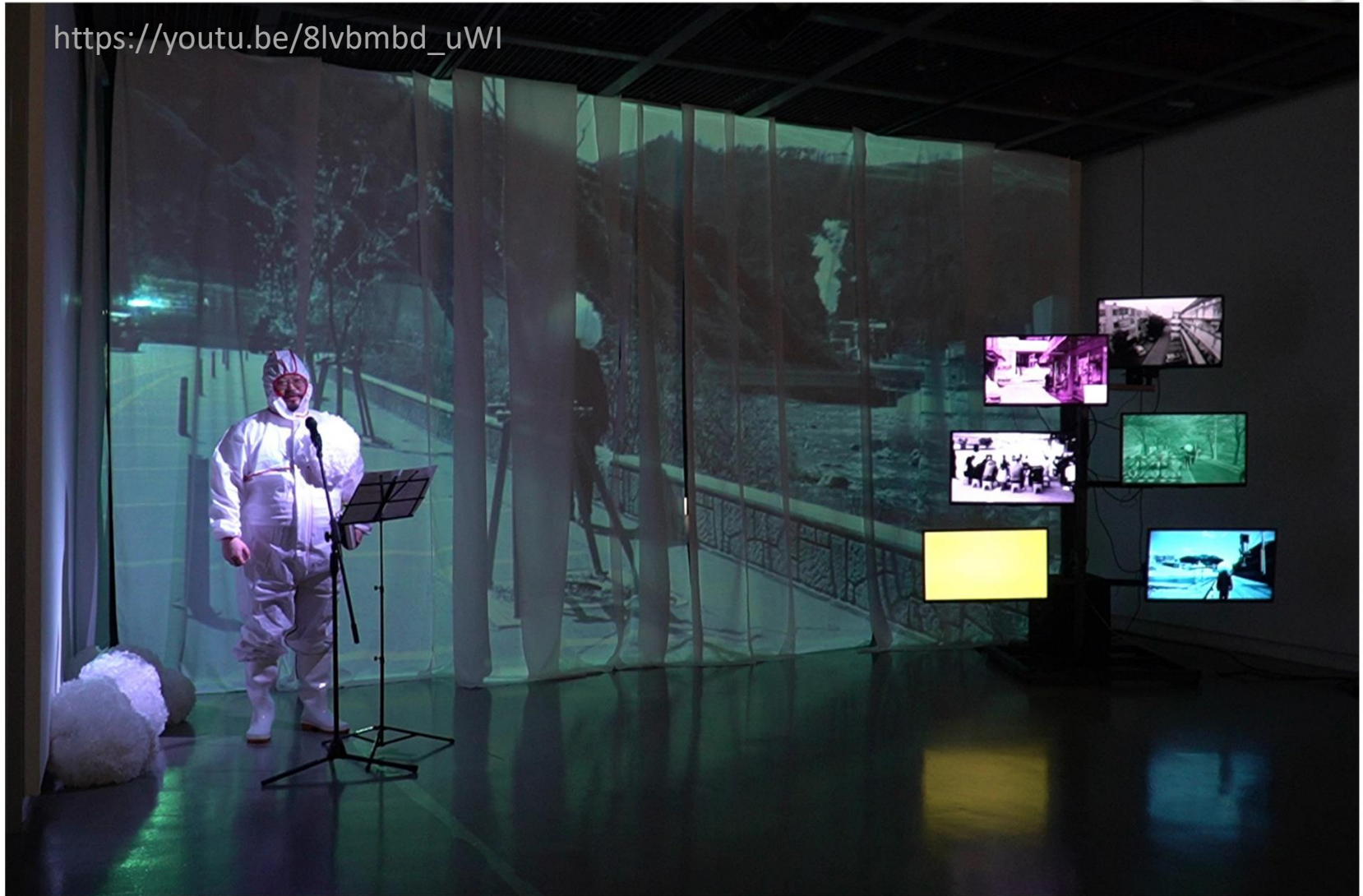
2019 Do it Theater, Digital JISIN Daegu Artfactory_2019