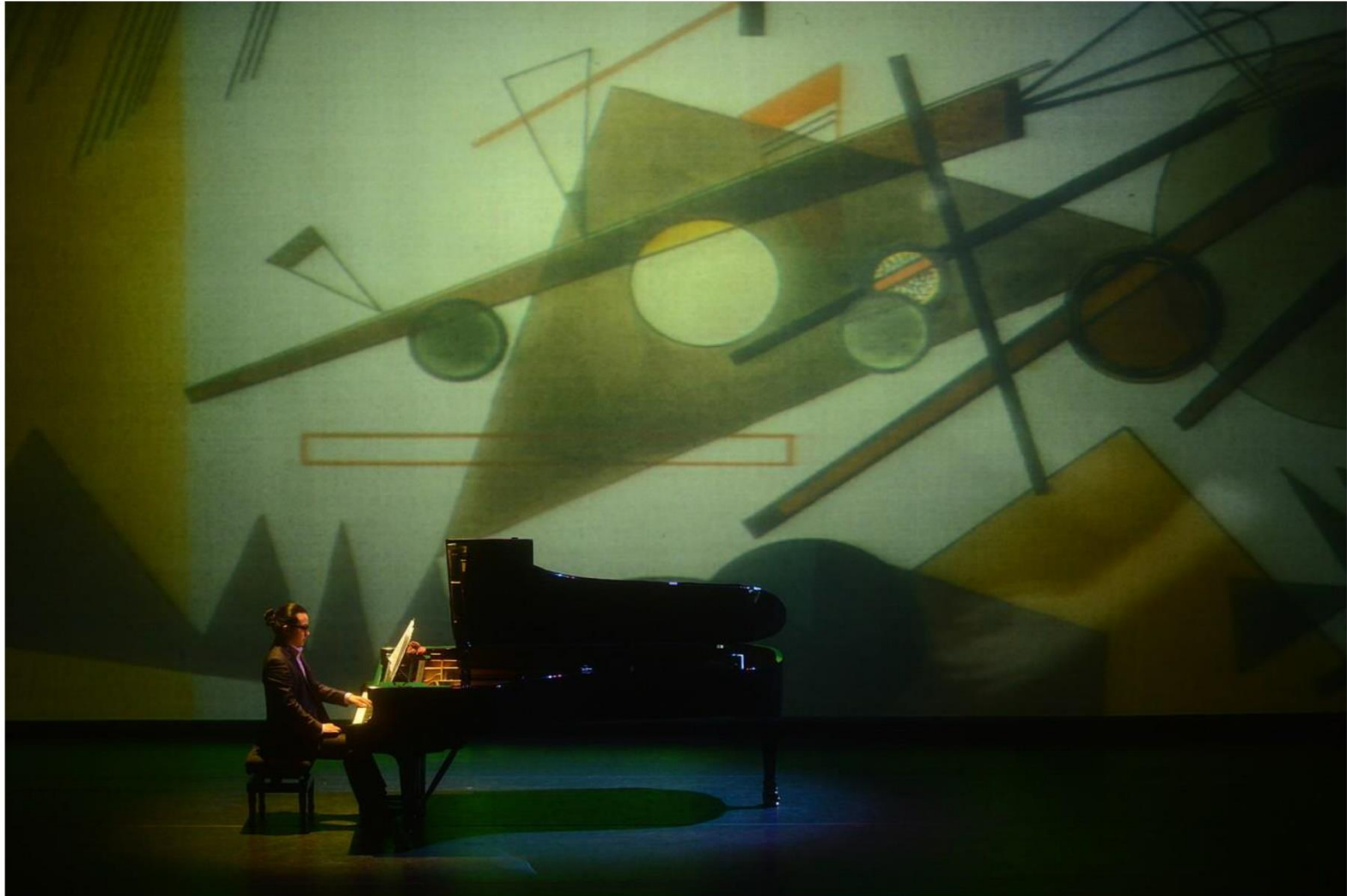
Picture at an exhibition _Ayang Art Hall, black box_2013

https://www.youtube.com/watch?v=86vtccPLISo